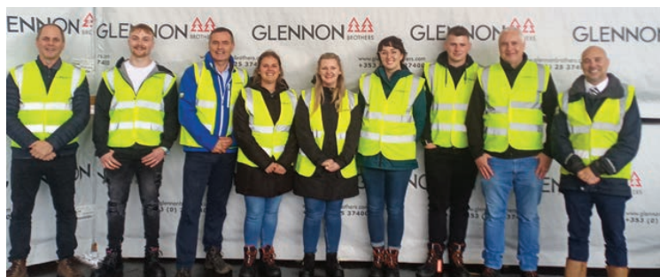
Bottom row (from left to right): The MEDITE factory tour The group at the Castlemartyr Resort At the MEDITE factory