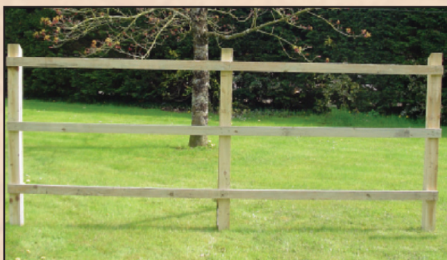
Splay Fencing 75 x 44

D – Rail 100 x 35 planed with eased edges is available in 3.6, 4.2 and 4.8 metre lengths.