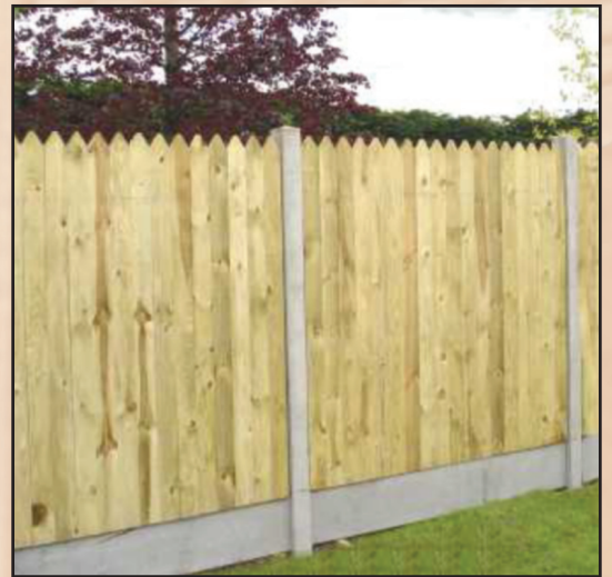
Champagne Top 100 x 22