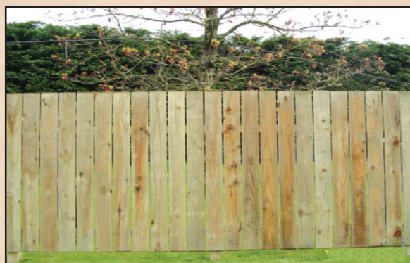
Weather Edge 150 x 22 (using Splay Fencing 75x44 as backing boards)