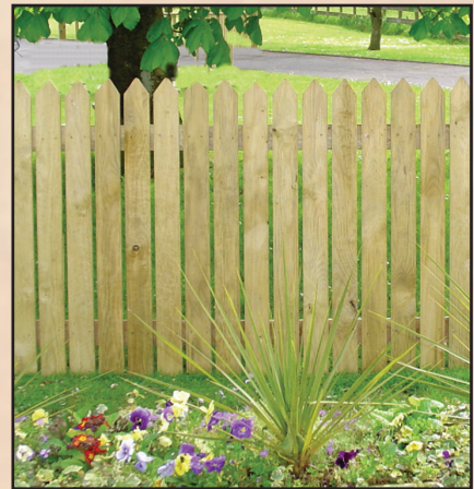
Champagne Top Ribbed 100 x 22