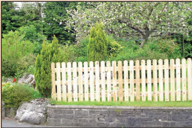
Round Top Ribbed 100 x 22

Strong and durable fencing for around the house and garden. Glenfence picket fencing is pre-made for a faster and more efficient way of fencing. Ribbed picket fencing uniquely displays the natural beauty of the board.