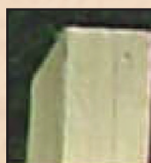
Square, Weathered 100x100