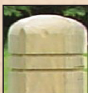
Round Top Par, 100x100