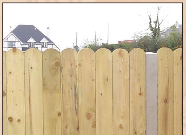
Round Top 150 x 22