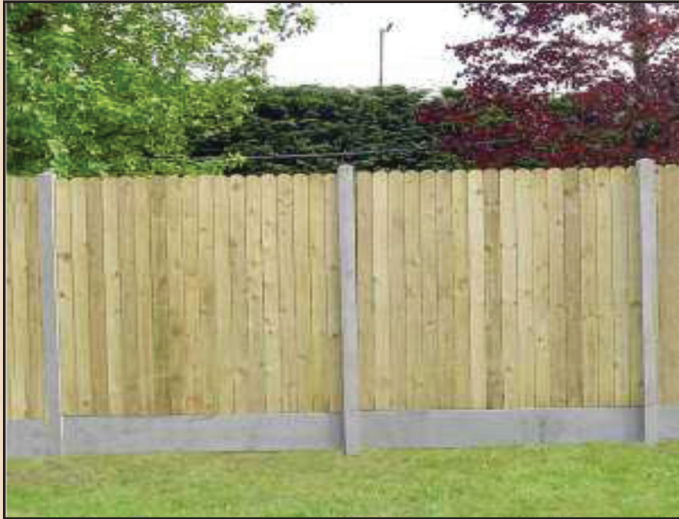
Round Top 100 x 22

Glenfence closed panels are easy to assemble – just slot them into the H Posts and walk away! Sturdy and strong with 40% thicker boards. Utilises a special backing board which maximises water run off, helping to prevent water damage.