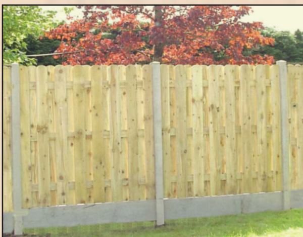
Hit & Miss 150 x 22