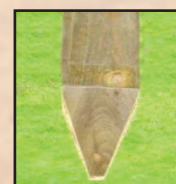
Square Pointed Post

• Longford: Tel (043) 50800 Fax 043 50806